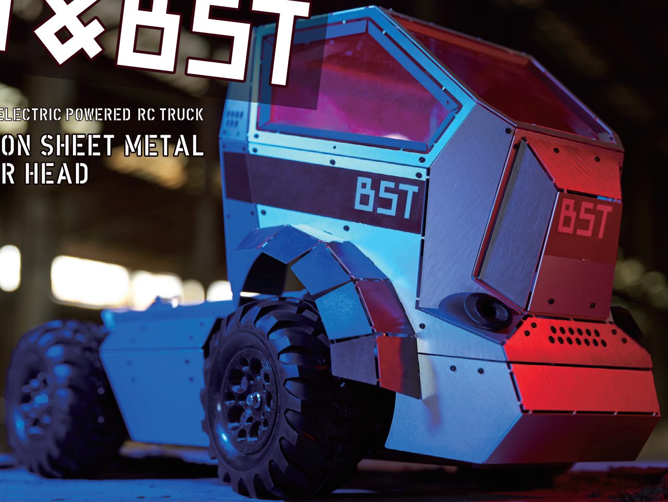
prototype: some finer details may differ on the production model.

1/10 SCALE ELECTRIC POWERED RC TRUCK PRECISION SHEET METAL TRACTOR HEAD